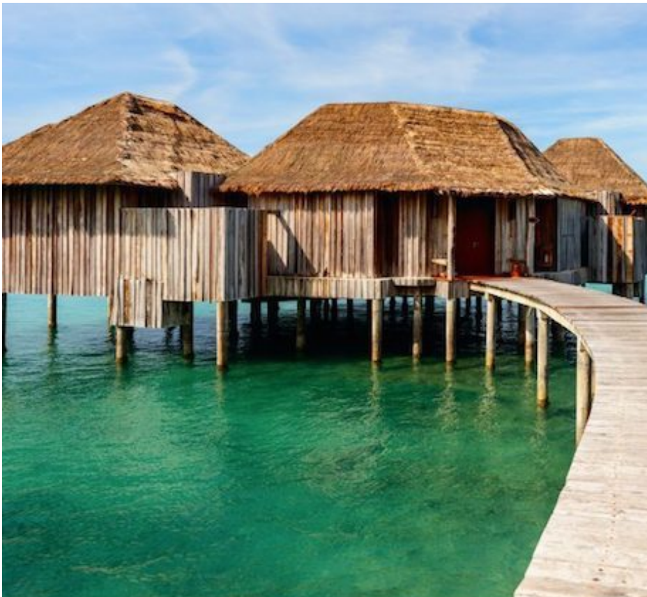
Featured image courtesy of Soneva Fushi, image #1 courtesy of The Harmony Hotel, image #2 courtesy of Mashpi Lodge, image #3 courtesy of Nihi, image #4 courtesy of Soneva Fushi, image #5 courtesy of Songsaa, image #6 courtesy of Jean-Michael Cousteau Resort, image #7 courtesy of Six Senses Qing Cheng Mountain